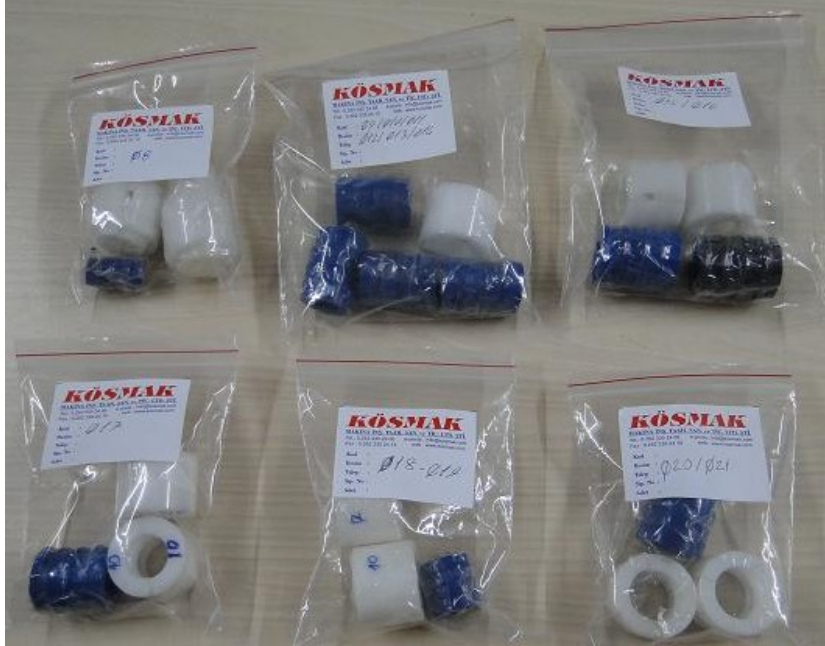
NUTRINGS AND NUTRING SEALS FOR DIFFERENT CABLES