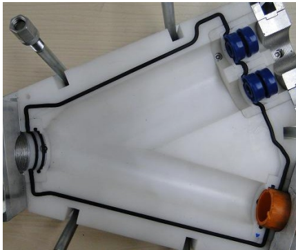
MONTAGING O-RINGS TO THE TOOL(bottom side)