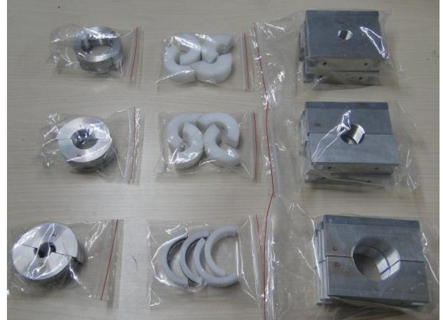
DUCT CLUMPING PARTS IN DIFFERENT DIAMETERS