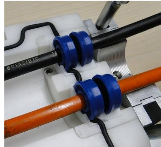
MONTAGING NUTRINGS TO THE TOOL