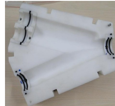
MONTAGING O-RINGS TO THE TOOL(upper side)