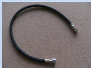
22) Shock lubricant box connection hose