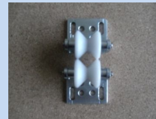
4) Cable Aligner \varnothing 9\sim\varnothing 13 / \varnothing 14\sim\varnothing 22 / \varnothing 6\sim\varnothing 11 / \varnothing 12\sim\varnothing 18 (1Set=2Pcs)