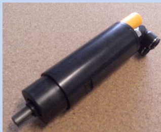
1) Air Engine