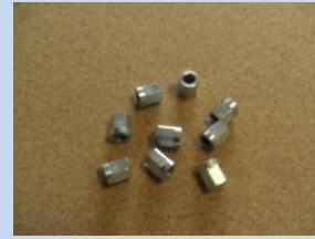
9) Exit Box Nuts