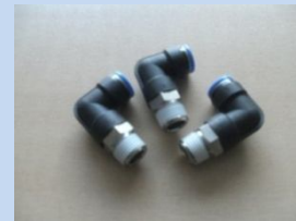
19) Air exit connectors.