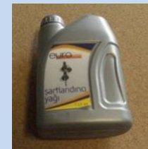
20) Air Preparation oil