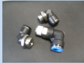
12) Direction Control valve air connectors. (1Set)