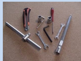
23) WRENCH SET