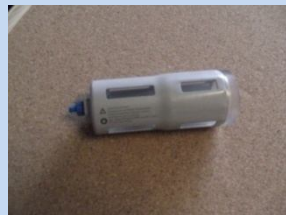
17) Water box