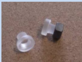
21) Shock lubricant box oil level windows.