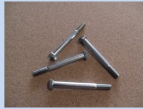
8) Exit Box Screws