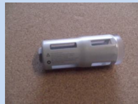
18) Oil box