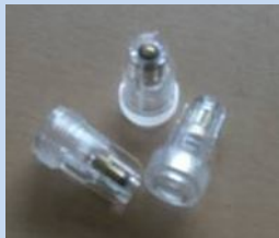
16) Oil flow setter of motors