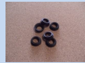
25) Exit Box air mouth seal