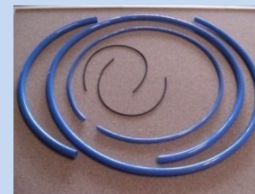
24) Air pipes