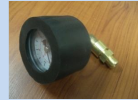
10) Pressure gauge (Exit box pressure gauge/Palette pressure gauge/ motor pressure gauge)