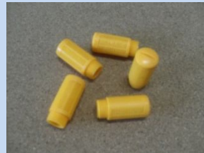
13) Silencer ( Same for engine and direction control valve)