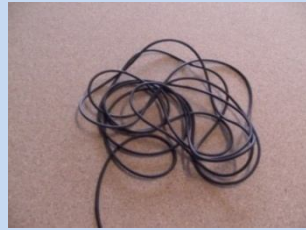
7) O-ring (1Mt)