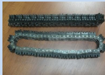
3) Palettes \varnothing 9\sim\varnothing 13 / \varnothing 14\sim\varnothing 22 / \varnothing 6\sim\varnothing 11 / \varnothing 12\sim\varnothing 18 (1Set=2Pcs)