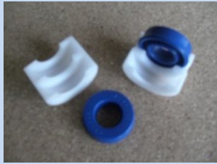
6) Exit Box Cable Seal (nutring outer diameter and thickness must be given)