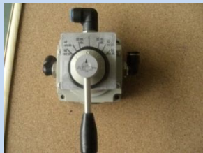
11) Palette direction control valve (1Set)