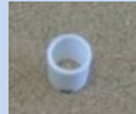
15) Air filter for air conditioner