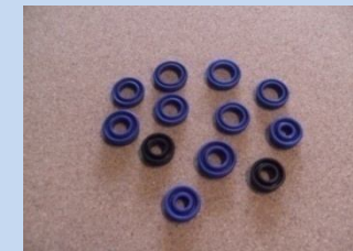
5) Nutring (cable diameter must be given)