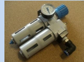
14) Air Conditioner (1 Set)